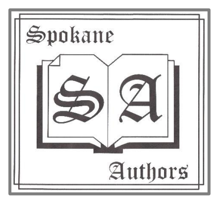
Page revised 12/23/2024 dam ©2023 www.spokaneauthors.org